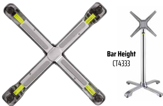
Bar Height CT4333