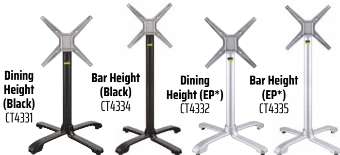
Dining Height (Black) CT4331